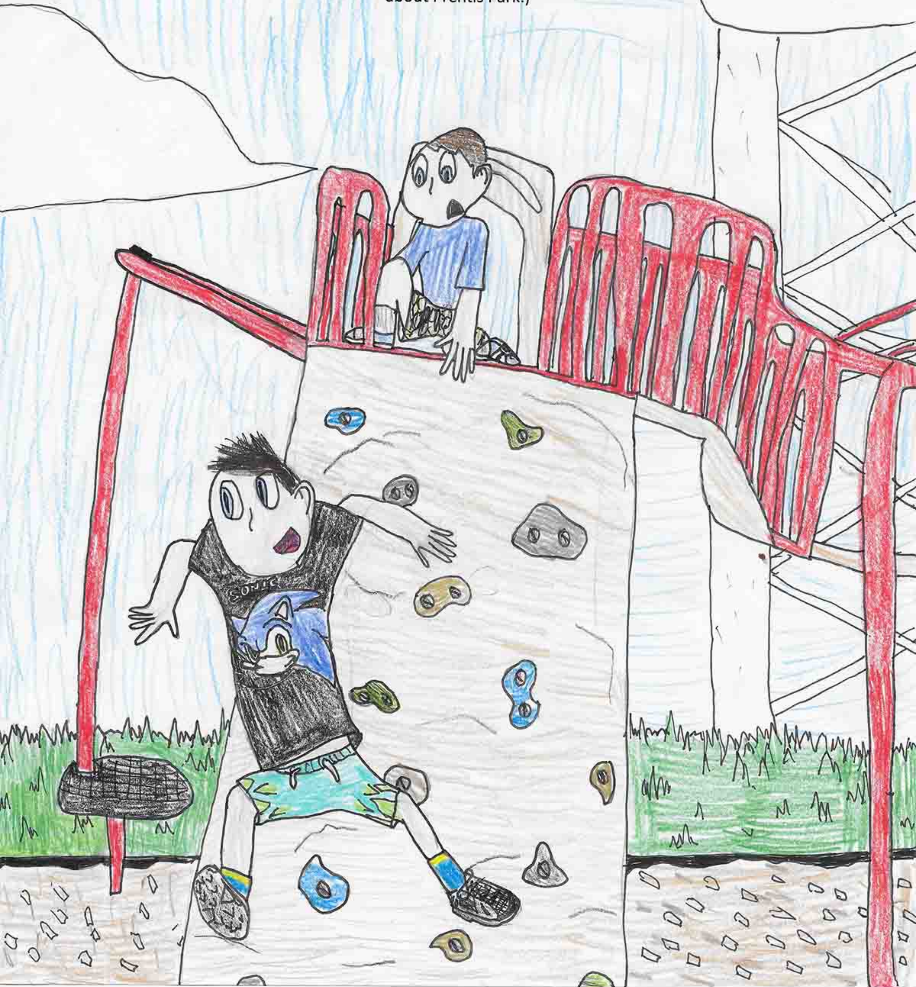
Caleb, Gr. 7, 1st place

(Please use the space below or your own 8.5x11 page below to create your drawing or painting about Prentis Park.)