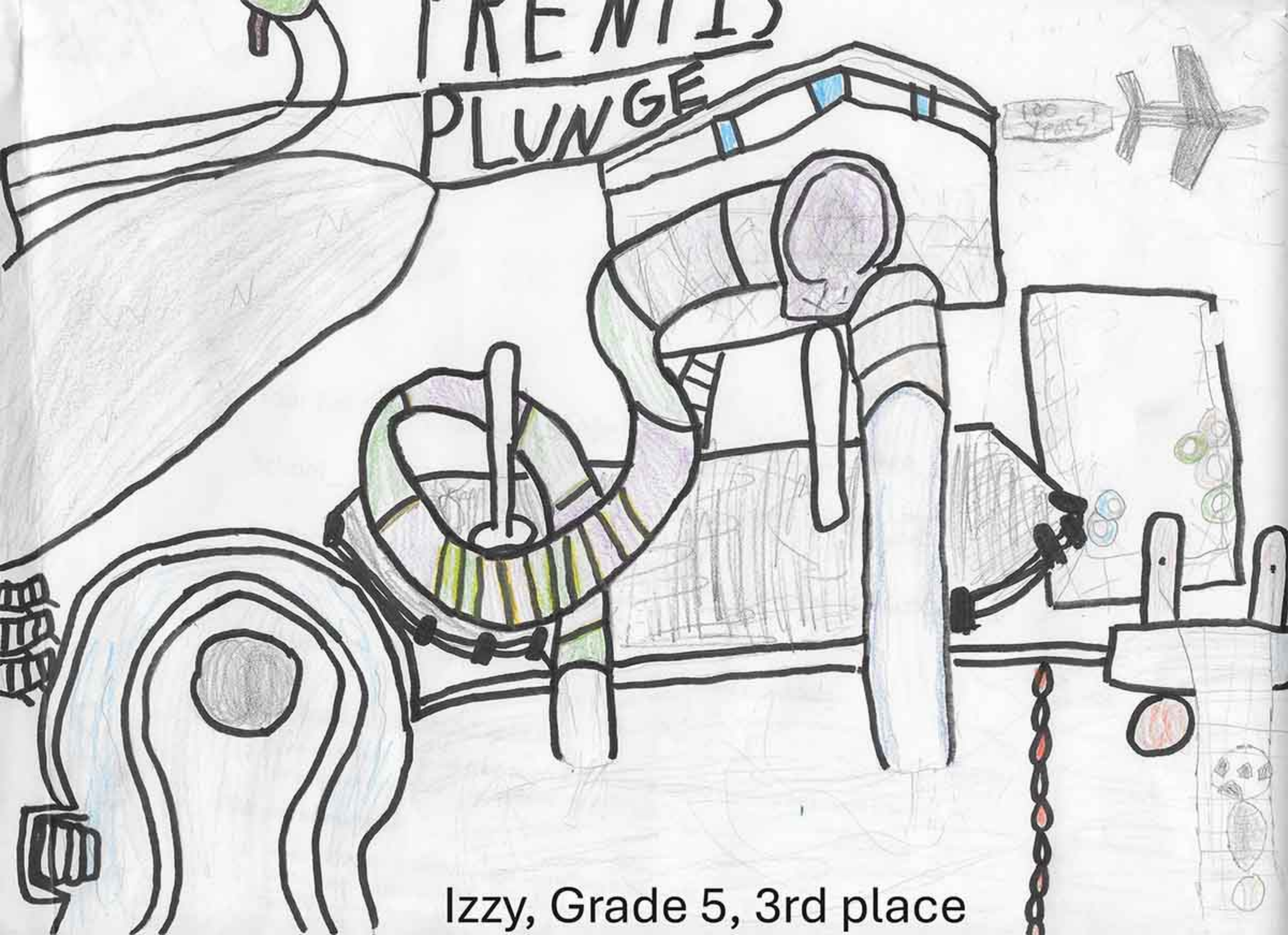
Izzy, Grade 5, 3rd place